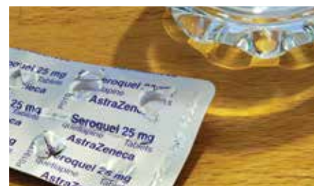
Quetiapine was the antipsychotic most often prescribed, in an unlicensed use

5 Working with pharmacists can make nurses more confident in questioning the appropriateness of antipsychotics